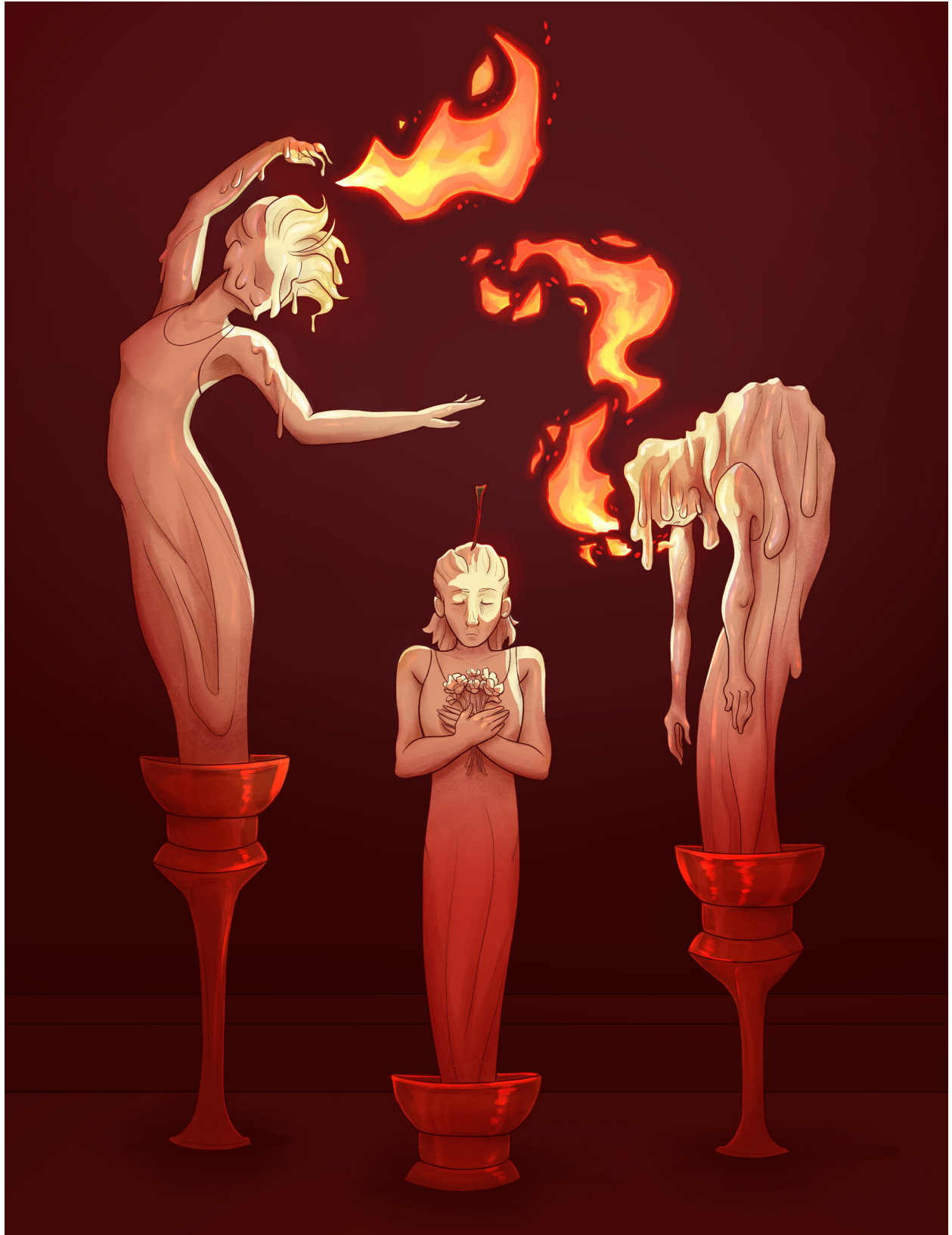
Midnight Oil - Nina Rafique