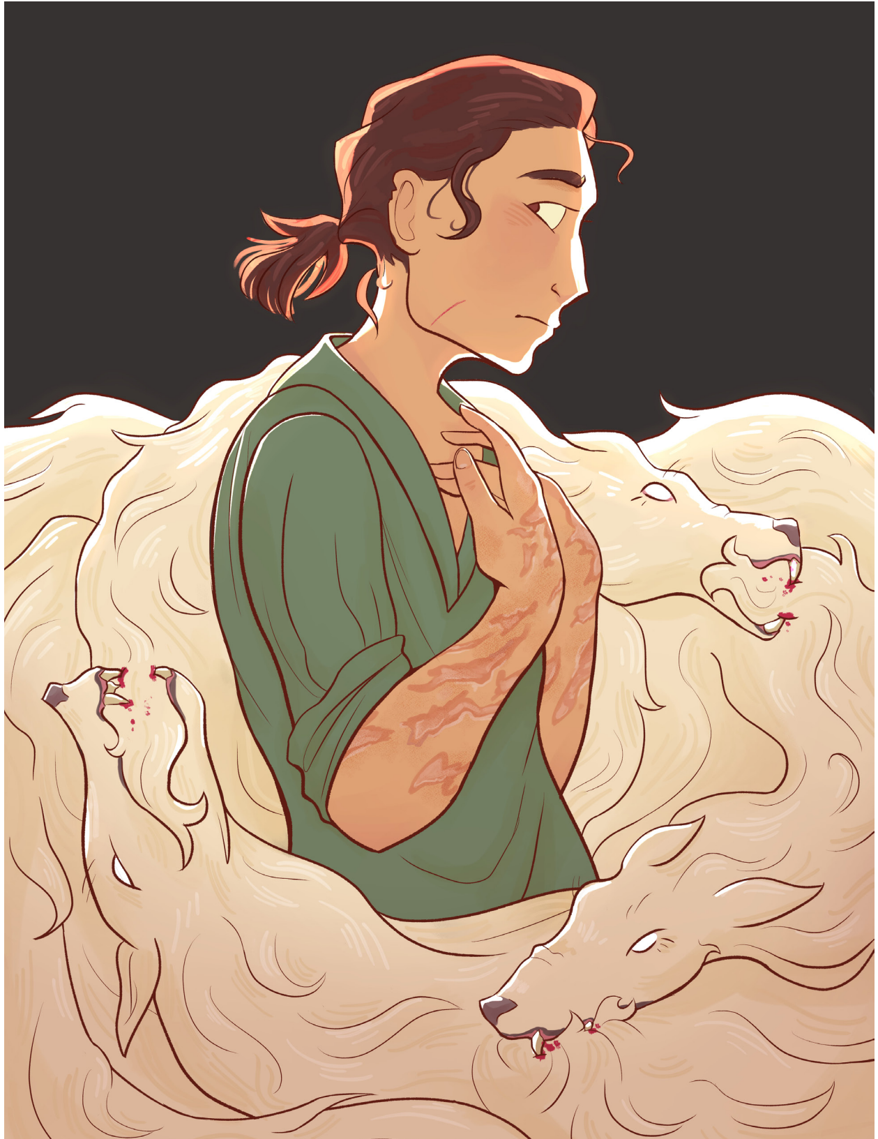
End of a Bloodline - Nina Rafique